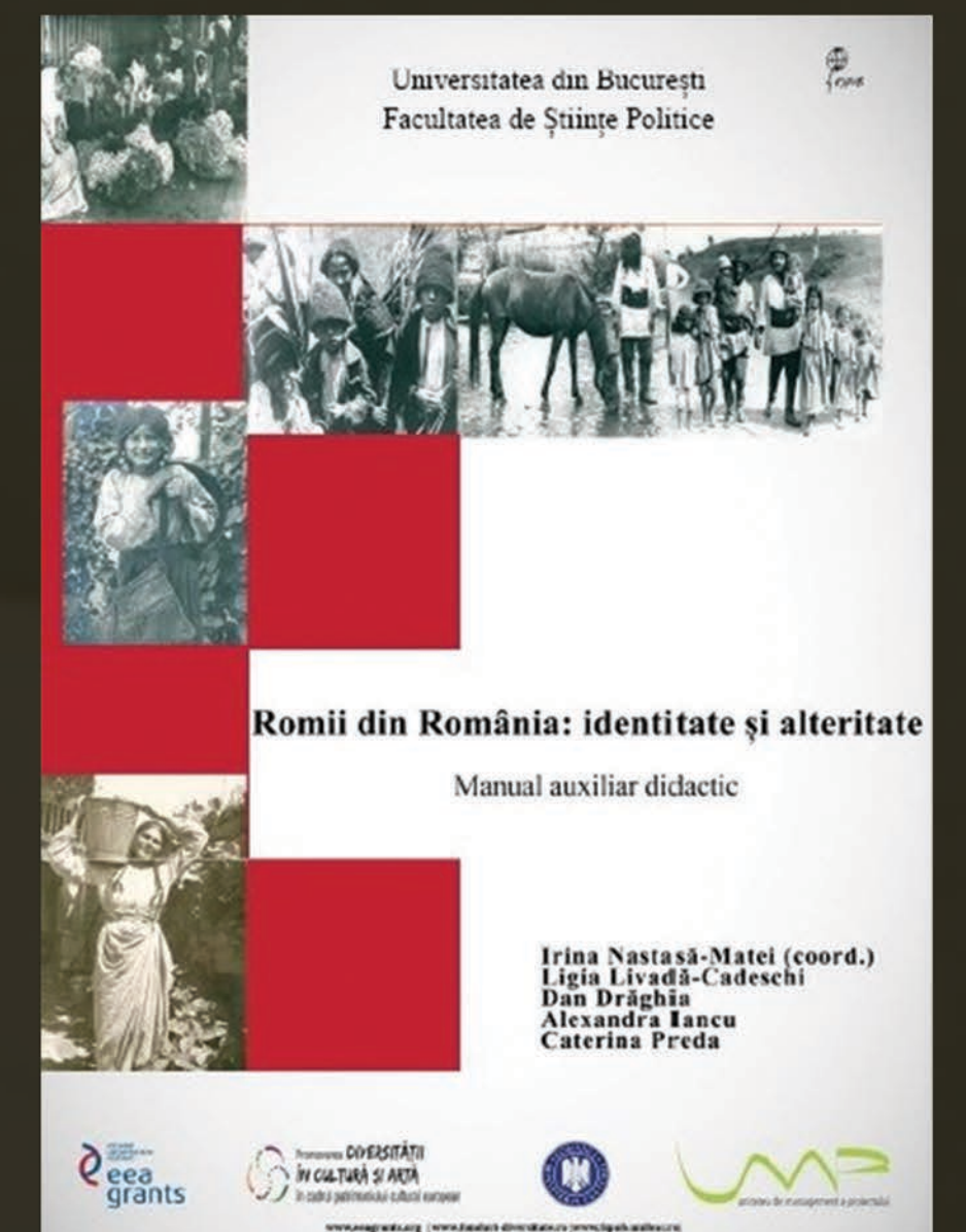
Roma in Romania: Identity & Alterity, handbook, 2016

Supporting the educational process about the history of the Roma minority in Romania by providing an easy accessible database with images