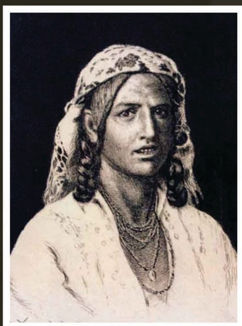
Theodor Aman, The Witch, 1870-1880

About the Roma minority in Romania through historical information and visual education