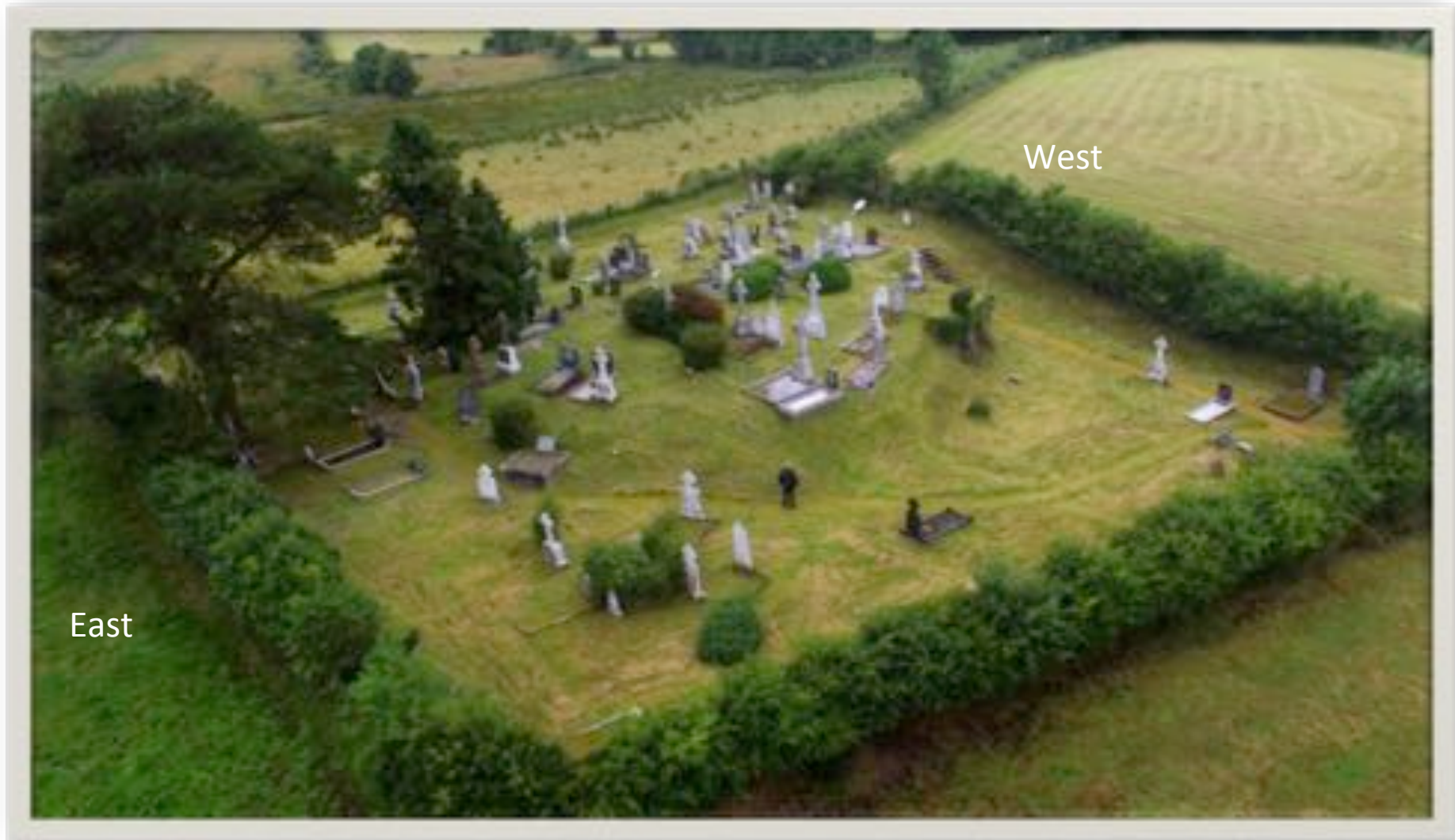
Drumahillen, drone photograph